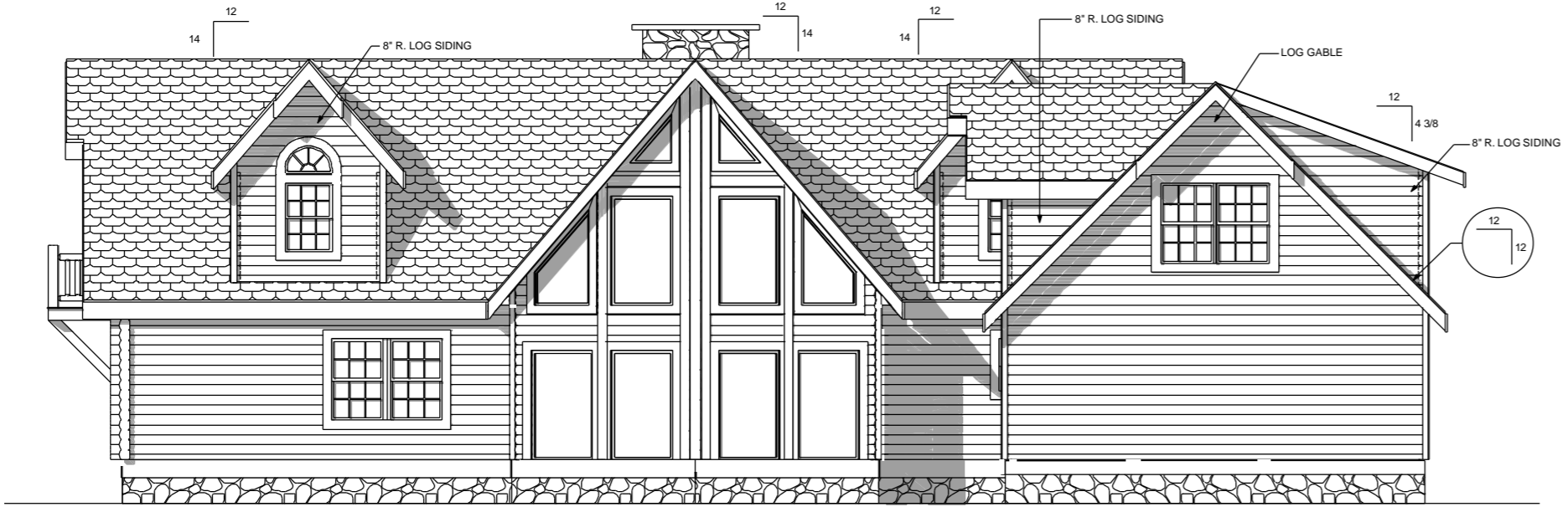
FRONT ELEVATION Scale: 1/4" = 1'-0"

NOTE A: IF THE CUSTOMER IS PURCHASING JBL'S SHINGLES, IN ORDER FOR THE WARRANTY TO BE GOOD ON ROOF PITCHES LESS THAN A 4/12 PITCH, YOU ARE REQUIRED TO USE TWO LAYERS OF FELT OVER THE ENTIRE ROOF UNDER QUESTION, STARTING WITH AN 15' STRIP ALONG THE EAVES AND CONTINUING WITH FULL 36" WIDE SHEETS OVERLAPING 19" OVER THE PRECEDING SHEET UNTIL THE ENTIRE DECK IS COVERED.