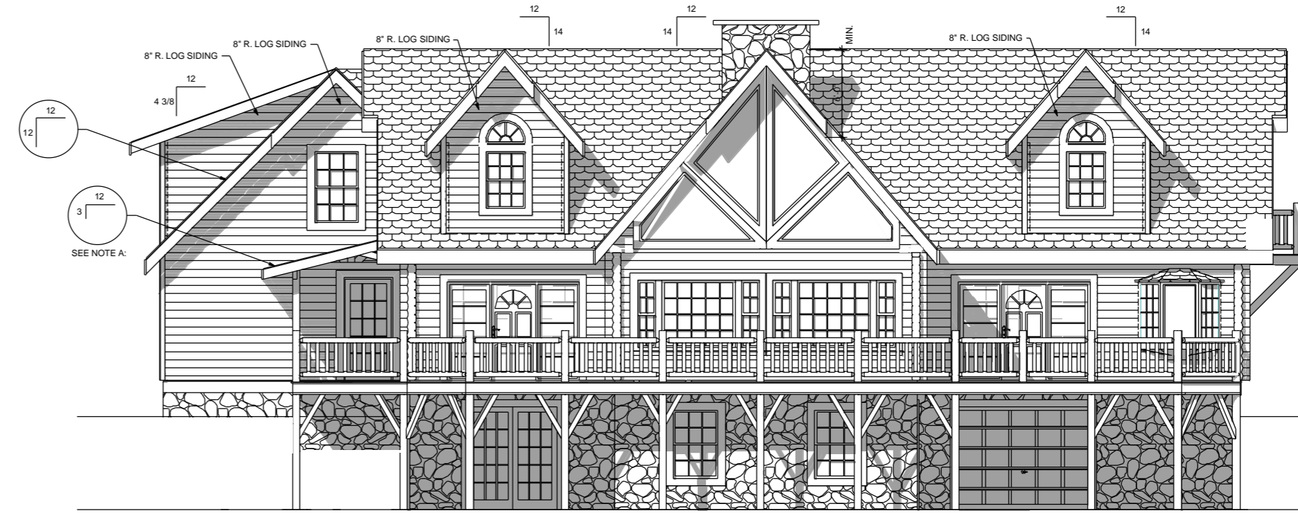
REAR ELEVATION Scale: 1/4" = 1'-0"

NOTE A: IF THE CUSTOMER IS PURCHASING JBL'S SHINGLES, IN ORDER FOR THE WARRANTY TO BE GOOD ON ROOF PITCHES LESS THAN A 4/12 PITCH, YOU ARE REQUIRED TO USE TWO LAYERS OF FELT OVER THE ENTIRE ROOF UNDER QUESTION, STARTING WITH AN 15' STRIP ALONG THE EAVES AND CONTINUING WITH FULL 36" WIDE SHEETS OVERLAPING 19" OVER THE PRECEDING SHEET UNTIL THE ENTIRE DECK IS COVERED.